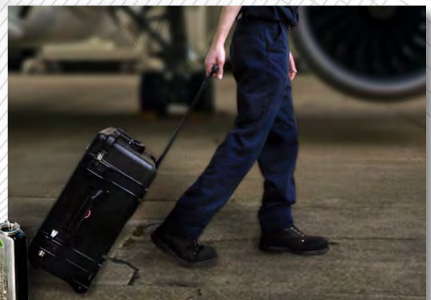
Easy to transport