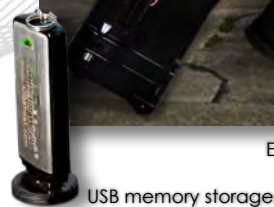
USB memory storage