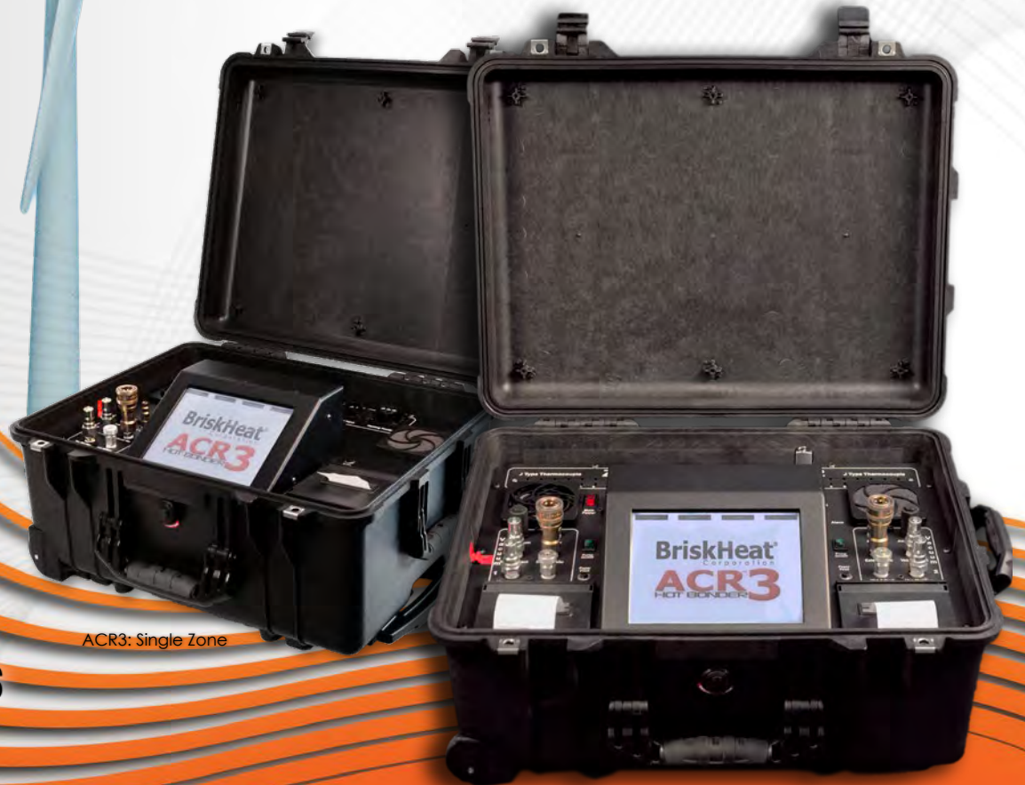
ACR3: Single Zone