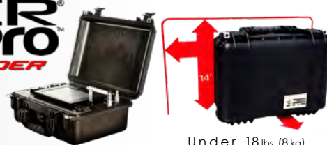
Under 18 lbs (8 kg)